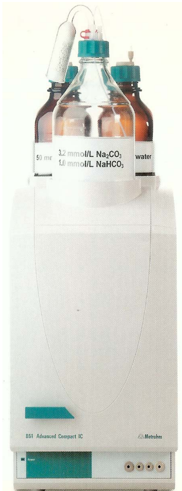
Metrohm 861 Advanced Compact Ion Chromatograph