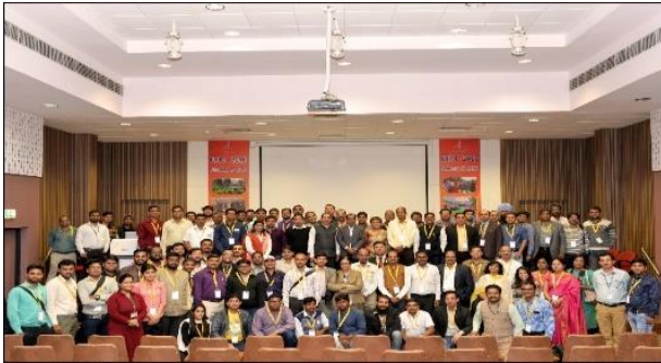
Feedback session during IIRS Academia Meet (IAM)-2020

IIRS has conducted workshops and sessions during IIRS User Interaction Meet to take feedback from participating institutions to improve the quality of future courses.