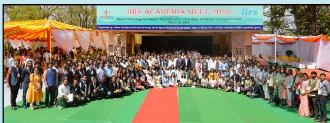
IIRS Academia Meet 2023

The Indian Institute of Remote Sensing (IIRS) is a constituent unit of Indian Space Research Organisation (ISRO), Department of Space, Govt. of India. Since its establishment in 1966, IIRS is a key player for training and capacity building in geospatial technology and its applications through training, education and research in Southeast Asia. The training, education and capacity building programmes of the Institute are designed to meet the requirements of Professionals at working levels, fresh graduates, researchers, academia, and decision makers. IIRS is also one of the most sought-after Institute for conducting specially designed courses for the officers from Central and State Government Ministries and stakeholder departments for the effective utilization of Earth Observation (EO) data. IIRS is also empaneled under Indian Technical and Economic Cooperation (ITEC) programme of Ministry of External Affairs, Government of India providing short term regular and special courses to international participants from ITEC member countries since 2001.