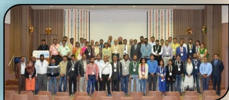
Feedback session during IIRS User Interaction Meet (IUIM)-2020

The participants can submit their feedback through online portal. Feedbacks are critically analyzed and implemented in next courses. For one to one feedback the participants and participating organizations are invited to attend annual IIRS User Interactive Meet (IUIM) at IIRS Dehradun.