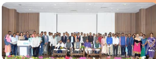
Feedback session during IIRS User Interaction Meet (UIM)-2023

IIRS takes continuous feedback from participating institutions to improve the quality of future courses.