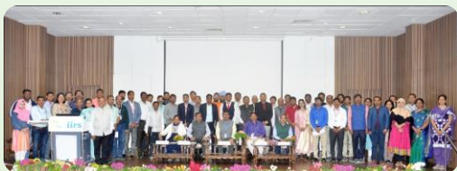
Feedback session during IIRS User Interaction Meet (UIM)-2020

IIRS takes continuous feedback from participating institutions to improve the quality of future courses.