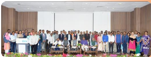
Feedback session during IIRS User Interaction Meet (UIM)-2023

IIRS takes continuous feedback from participating institutions to improve the quality of future courses.