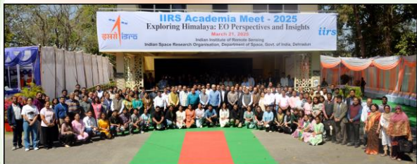
Feedback session during IIRS Academia Meet-2025

IIRS takes continuous feedback from participating institutions to improve the quality of future courses.