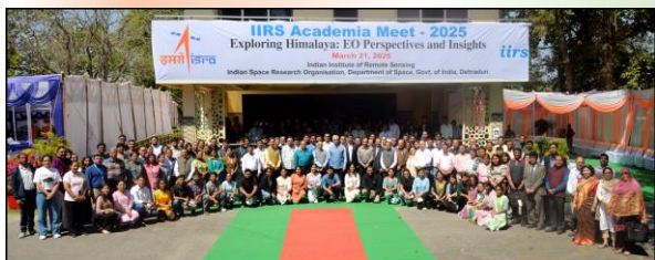
Feedback session during IIRS Academia Meet-2025

IIRS takes continuous feedback from participating institutions to improve the quality of future courses.