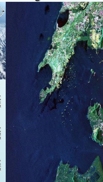
RISAT-1 FRS-2 mode Quad-Pol data over Mumbai, India