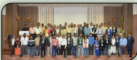
Feedback session during IIRS User Interaction Meet (UIM)-2020

IIRS has conducted eleven workshops in 2007, 2009, 2010, 2013, 2014, 2015, 2016, 2017, 2018, 2019 and 2020 to take feedback from participating institutions to improve the quality of future courses.