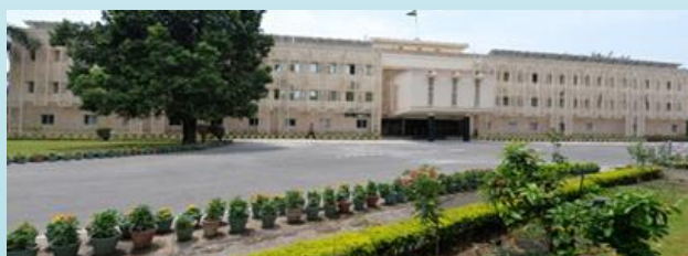
IIRS Main Building

The Indian Institute of Remote Sensing (IIRS) is a constituent unit of Indian Space Research Organisation (ISRO), Department of Space, Govt. of India. Since its establishment in 1966, IIRS is a key player for training and capacity building in geospatial technology and its applications through training, education and research in Southeast Asia. The training, education and capacity building programmes of the Institute are designed to meet the requirements of Professionals at working levels, fresh graduates, researchers, academia, and decision makers. IIRS is also one of the most sought after Institute for conducting specially designed courses for the officers from Central and State Government Ministries and stakeholder departments for the effective utilization of Earth Observation (EO) data. IIRS is also empaneled under Indian Technical and Economic Cooperation (ITEC) programme of Ministry of External Affairs, Government of India providing short term regular and special courses to international participants from ITEC member countries since 2001.