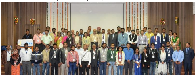
IIRS Outreach programme feedback session during IIRS User Interaction Meet (IAM)-2020

IIRS has conducted workshops and sessions during IIRS User Interaction Meet to take feedback from participating institutions to improve the quality of future courses.